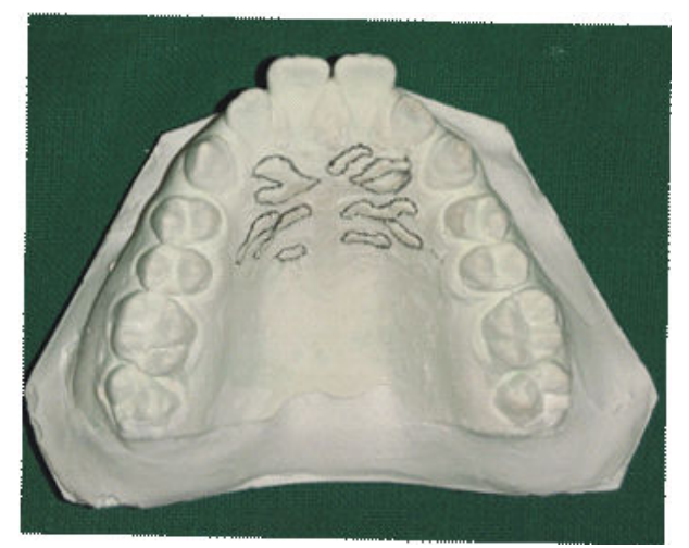
Fig. 1: Calcorrugoscopy of the dental cast model

In this study, Nayaket al [11] method was used to assess the palatal rugae pattern on the dental casts. During the examination of the palate, no two palatal rugae patterns were found identical. Each rugae were analyzed in this study and the incidence of the rugae patterns and its association with sex was tested using Chi-square test.